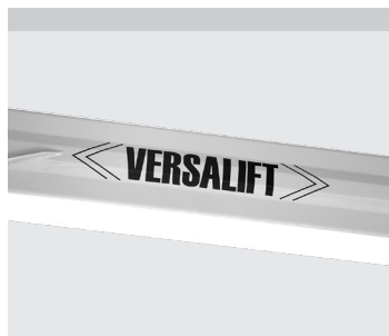
2 stage telescopic boom with articulating flyboom