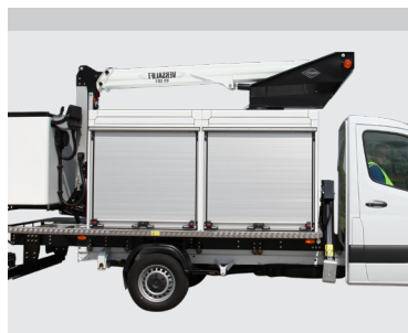
Cabinets for the chassis (1 cabinet optional)