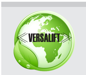
Lithium-Ion power pack (optional)