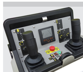
LMC controls with variable outreach