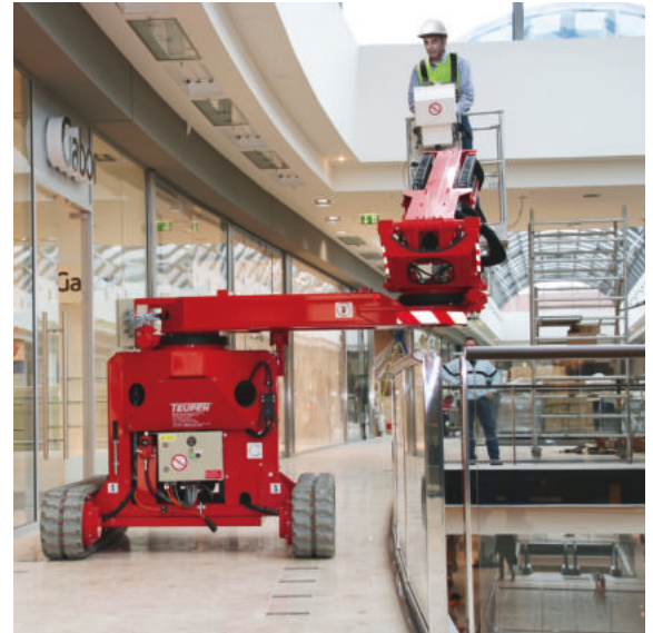
Can be driven from the platform