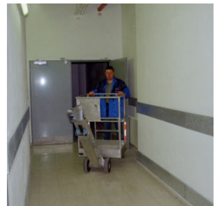
Removable platform and jib