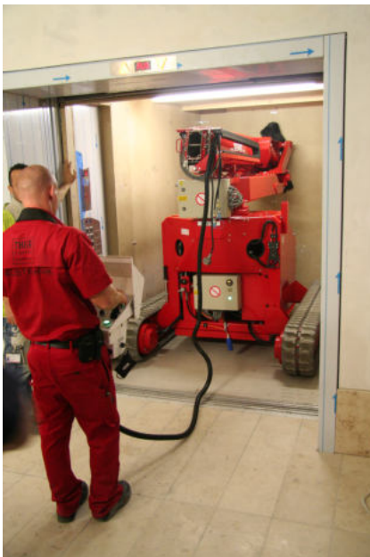
Compact design to fit in freight elevators