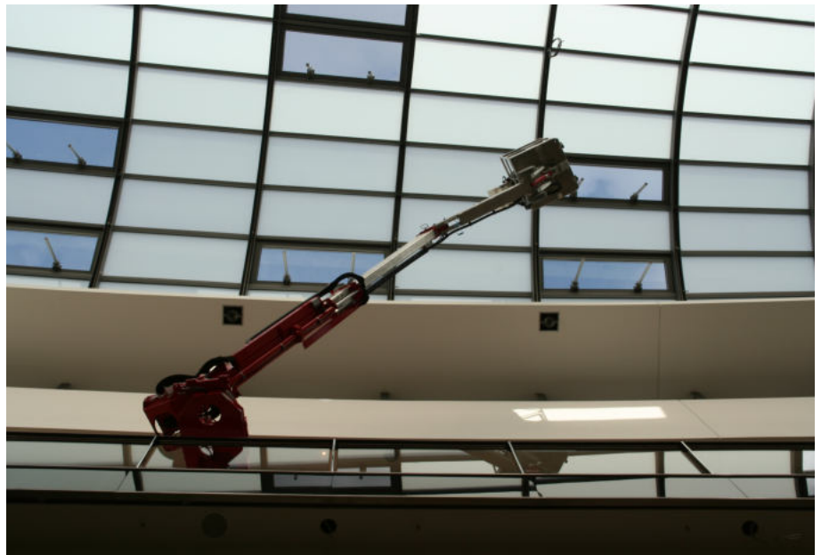
Working over railings