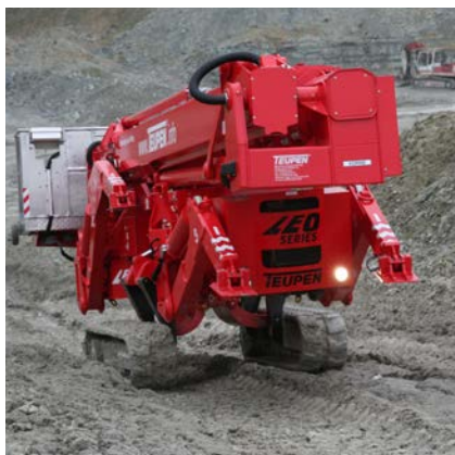
Hydraulically height- and width adjustable crawler tracks for driving on slopes