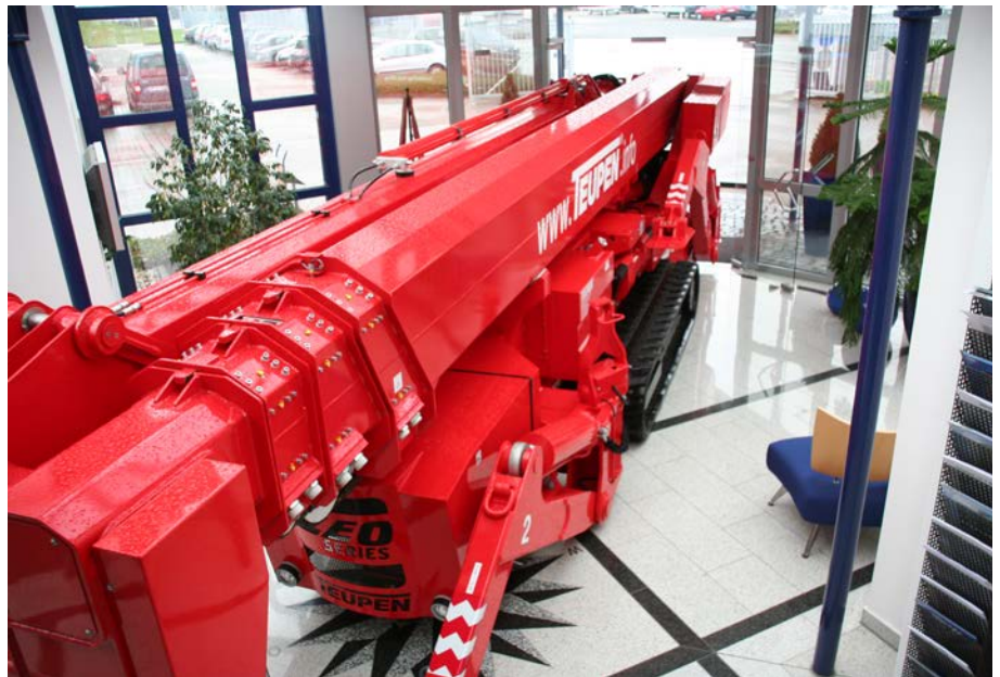
Travels through a double door and has a low surface load on sensitive floors