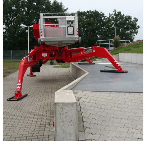
Setting up on ground slopes up to 16,7 ° / 30,0 %