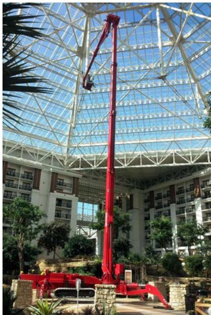
LEO40GTX - for indoor and outdoor use