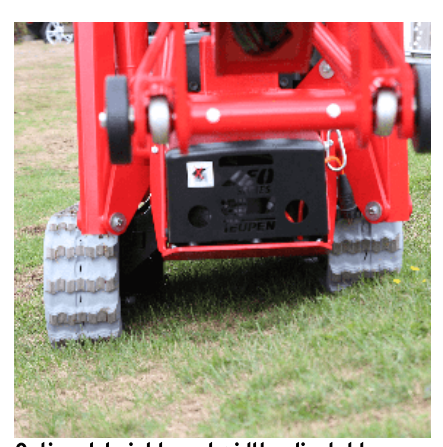
Optional: height- and width adjustable crawler tracks