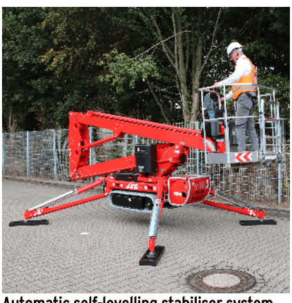
Automatic self-levelling stabiliser system