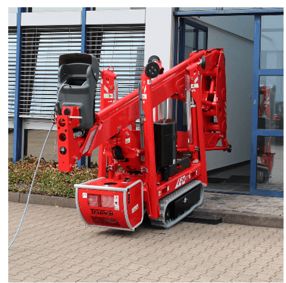
Minimum pass-through width of 0,78 m due to the removable platform