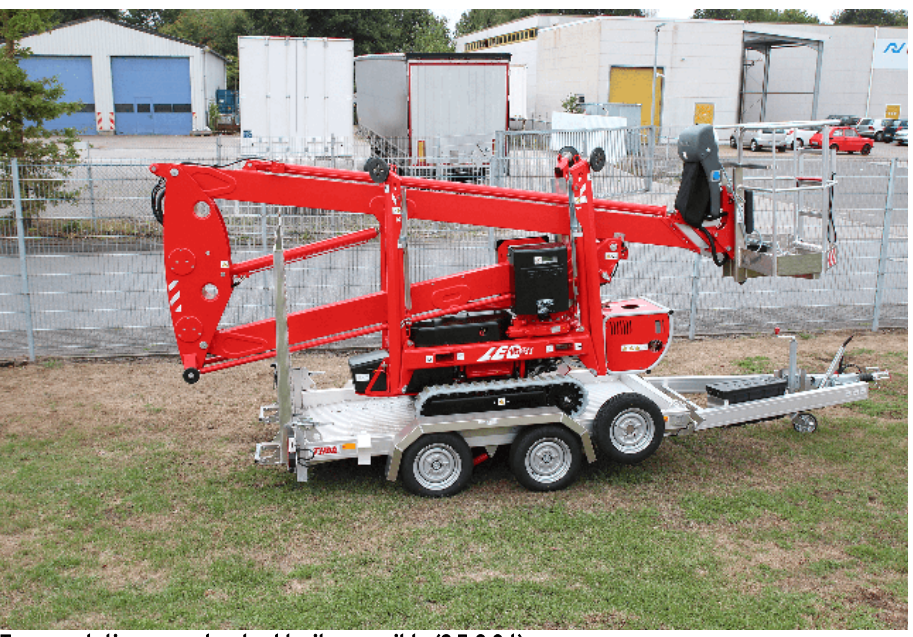
Transportation on a standard trailer possible (2,5-3,0 t)