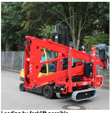
Loading by forklift possible