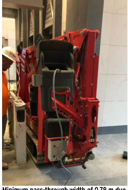
Minimum pass-through width of 0,78 m due to the removable platform