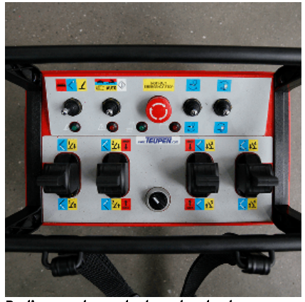
Radio remote control as standard