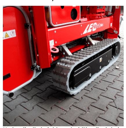
Hydraulically height- and width adjustabale crawler tracks for driving on slopes