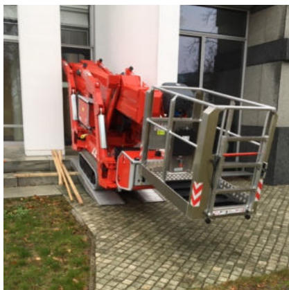
Minimum pass through width of 0,98 m