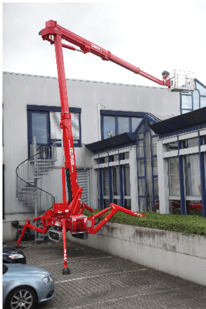
Setting up on ground slopes up to 19,0 ° / 34,0 %