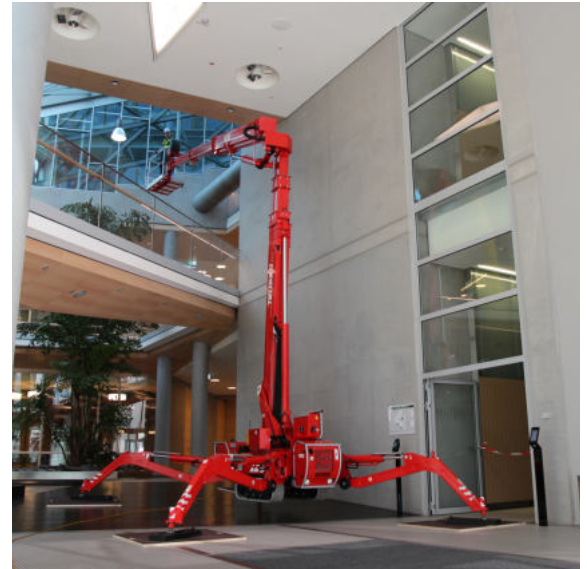
Upper and lower boom can be operated independently for overcoming barriers