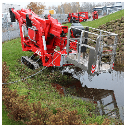
Hydraulically height- and width adjustable crawler tracks for driving on slopes