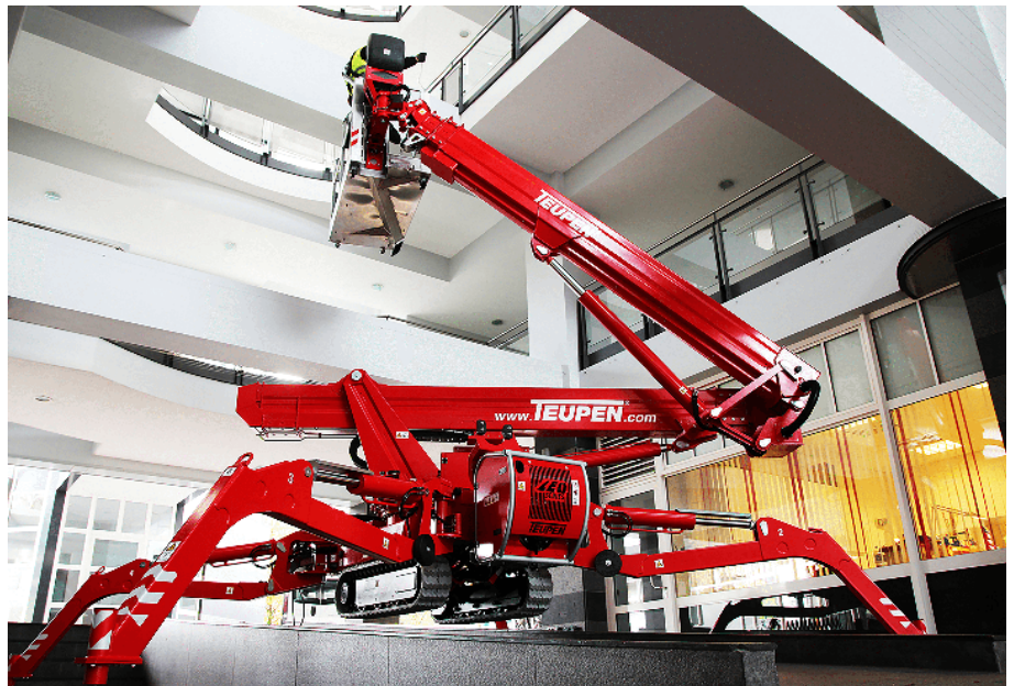
Turntable rotation (450 °) Rotatable platform (2x 90 °)